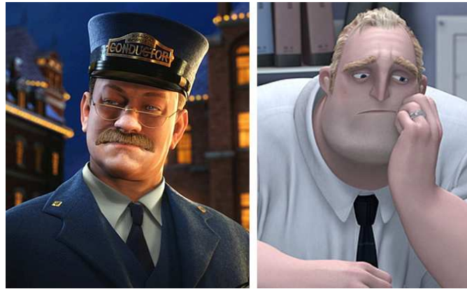
The Polar Express - The Incredibles