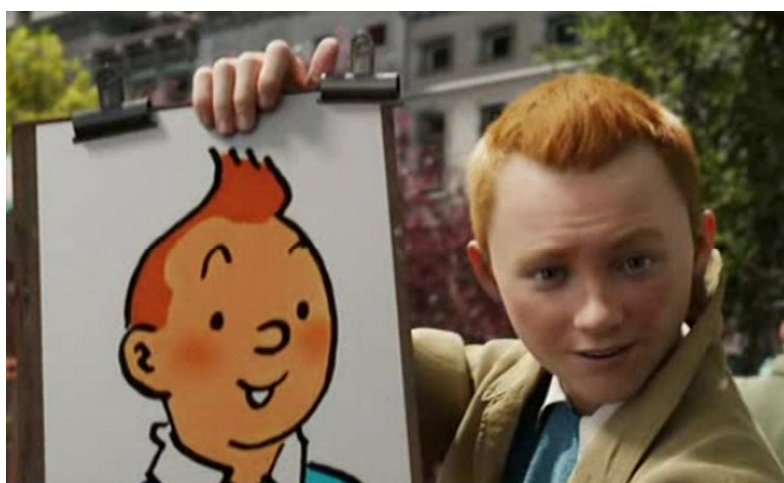
The Adventure of The Tintin: The Secret of the Unicorn time: 4:55

The recreation of Tintin from the original drawings of Herge is another reason for Tintin to become more successful than the other samples. When Tintin first appears in the movie, Tintin shows Herge's original drawing and asks the question "What do you think?" This may actually be a question which is directed to the audience. Spielberg and Jackson may have started such adventure, aiming at going beyond the borders of the uncanny valley.